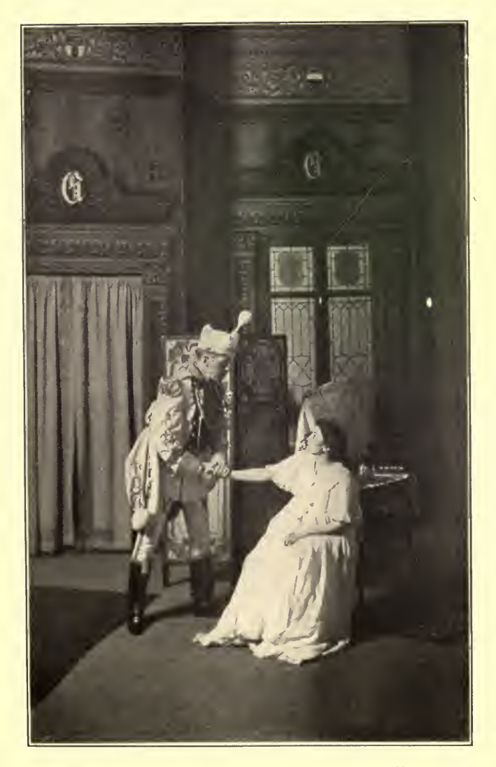
"I'M SORRY YOU ARE THE PRINCESS."